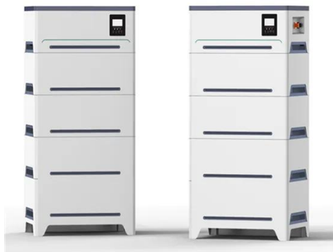
Photo Voltaic module storage racks